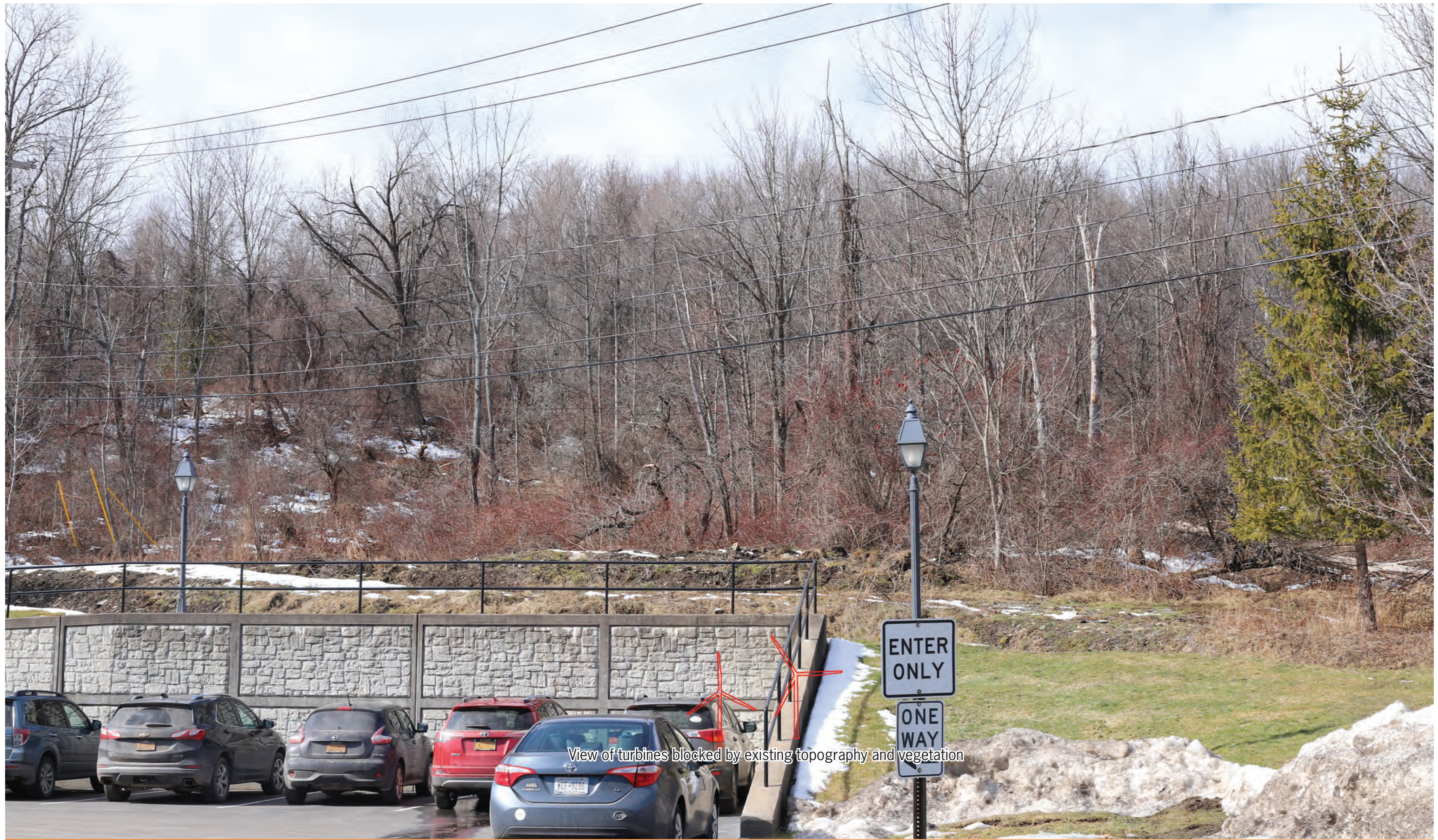
View of turbines blocked by existing topography and vegetation