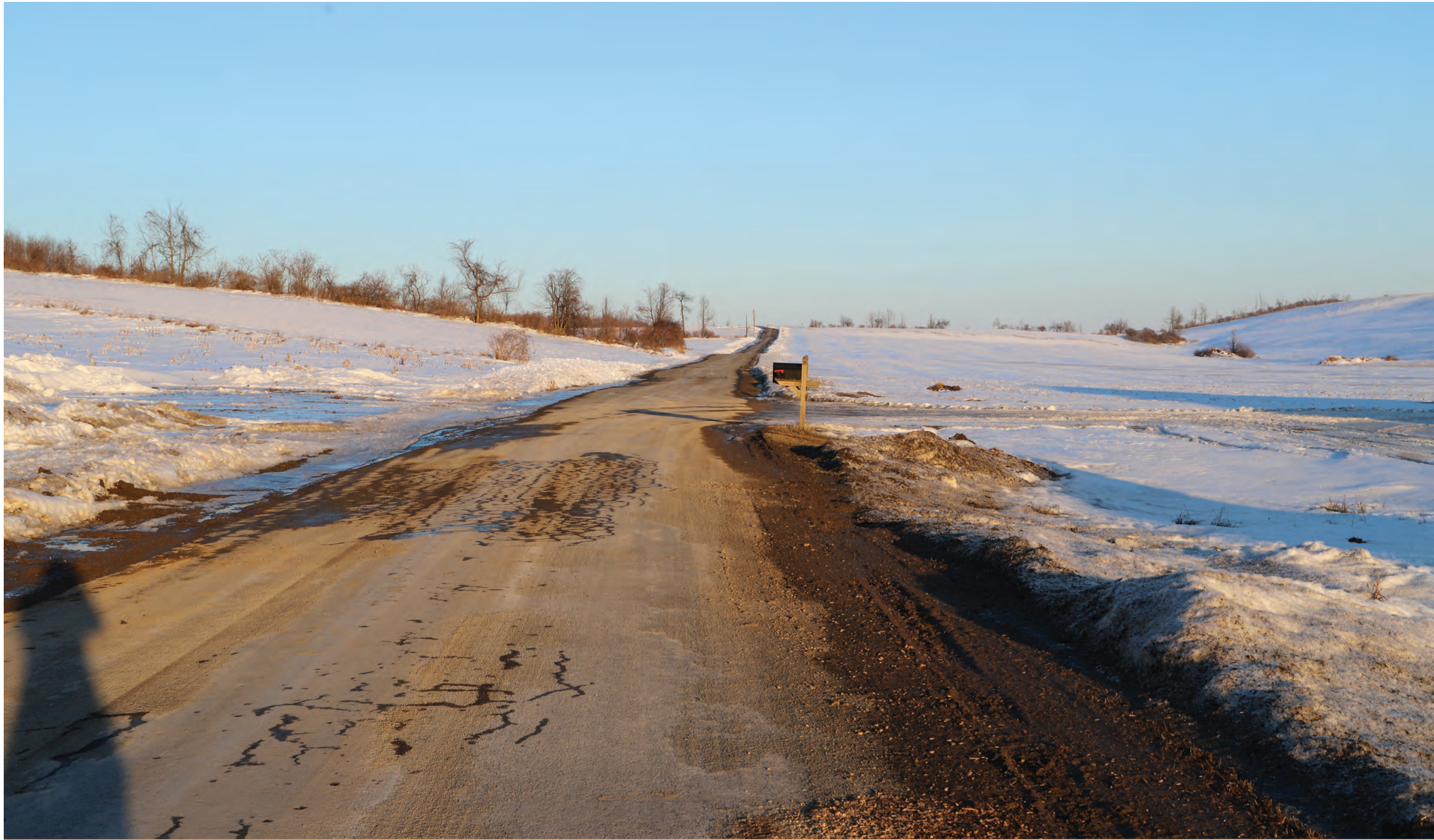
Photo 3 - Parmwood Rd. EXISTING CONDITION