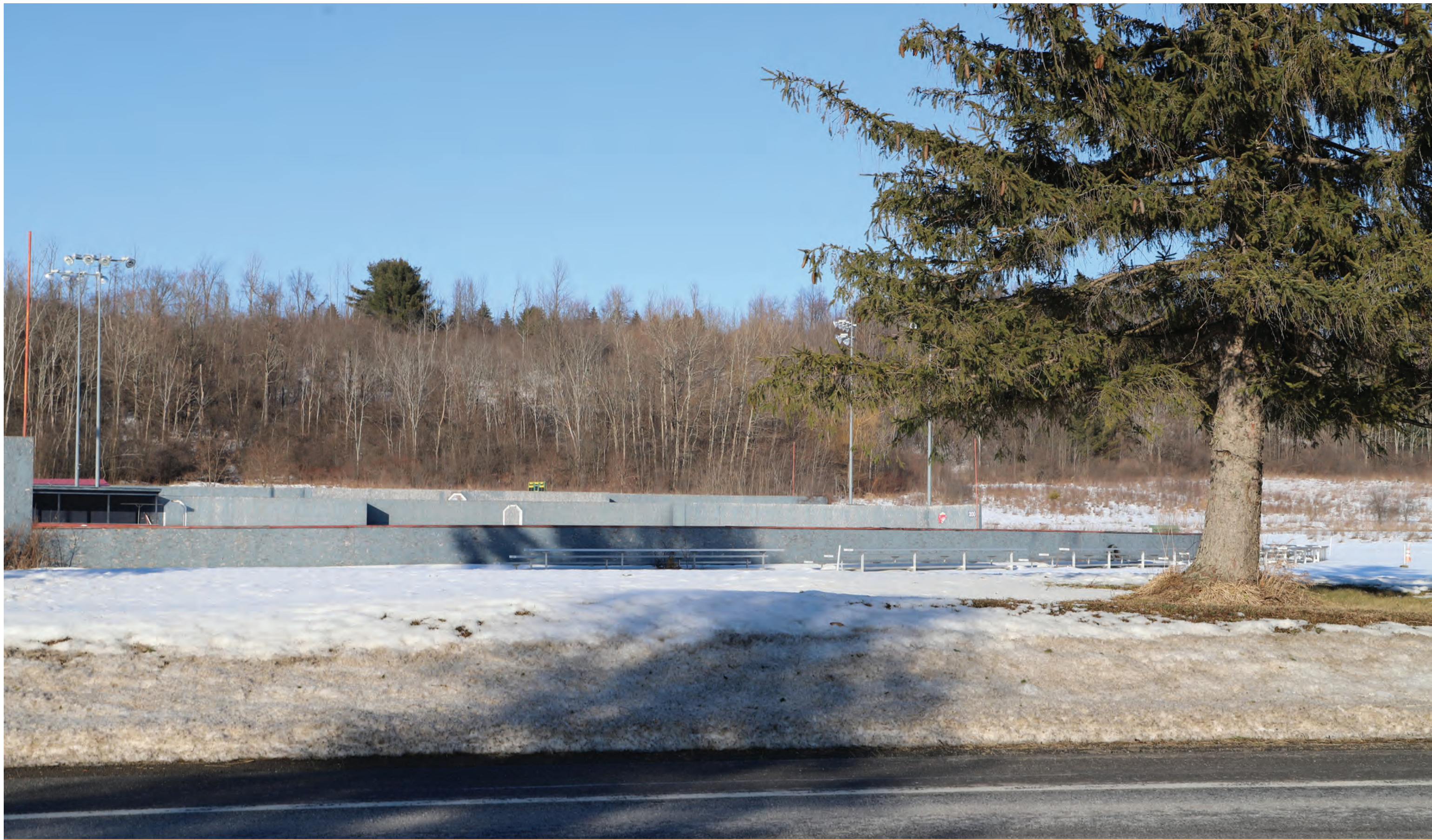
Photo 4 - US Hwy. 20 EXISTING CONDITION