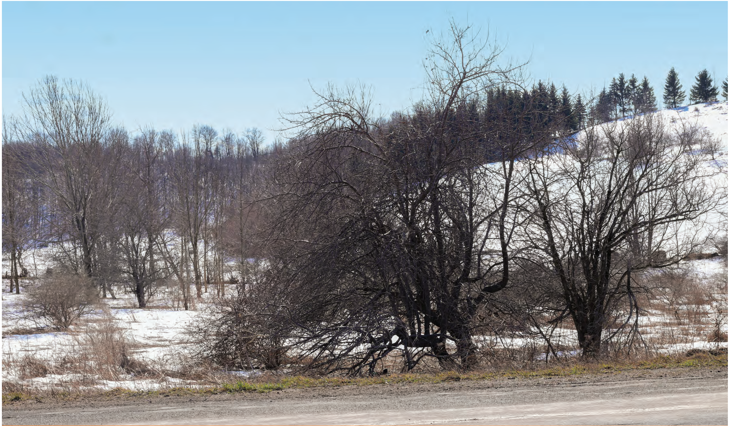
Photo 11 - Jordanville Rd. EXISTING CONDITION