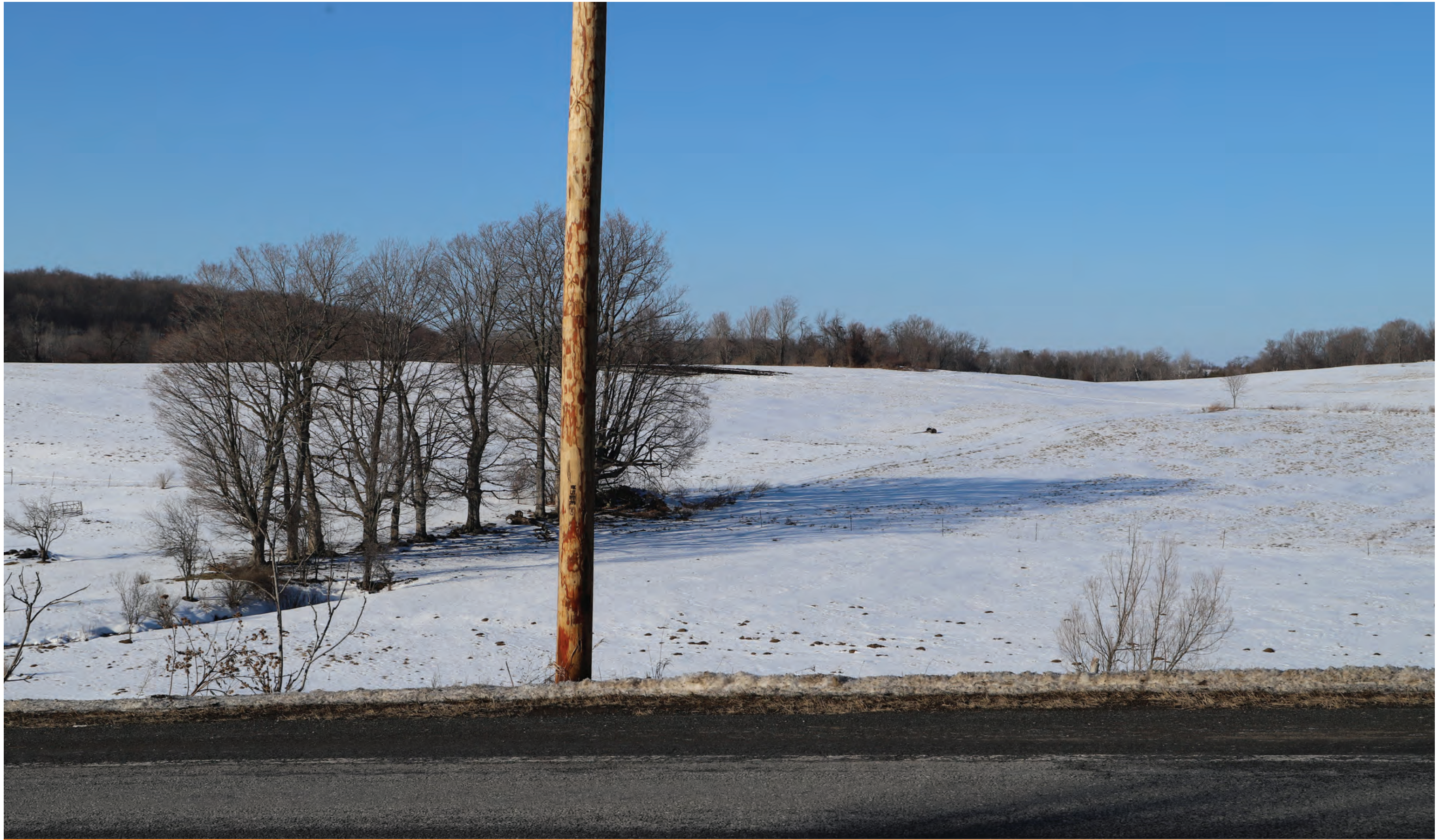
Photo 5 - US Hwy. 20 EXISTING CONDITION