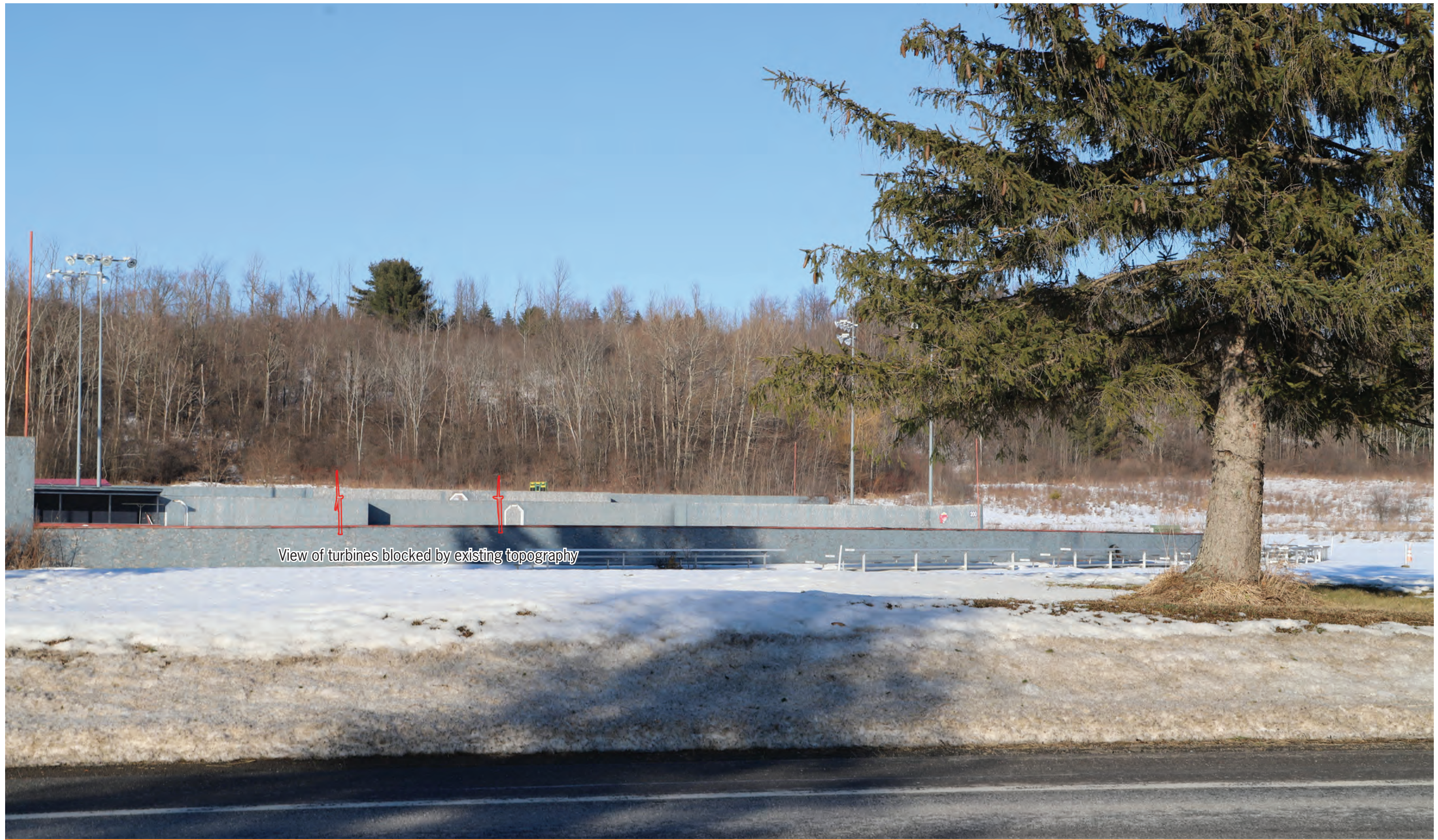
Photo 4 - US Hwy. 20 SIMULATED CONDITION