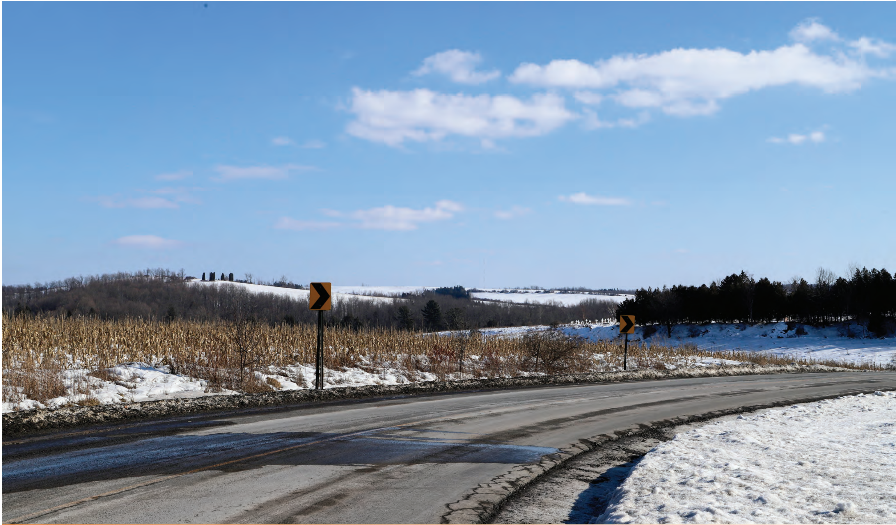
Photo 1 - Robinson Rd EXISTING CONDITION