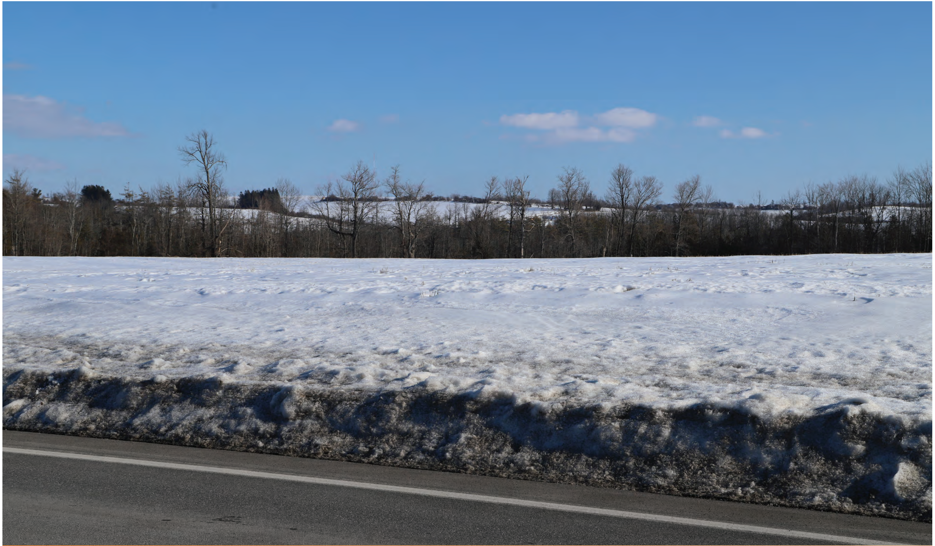
Photo 2 - Rte. 167 EXISTING CONDITION