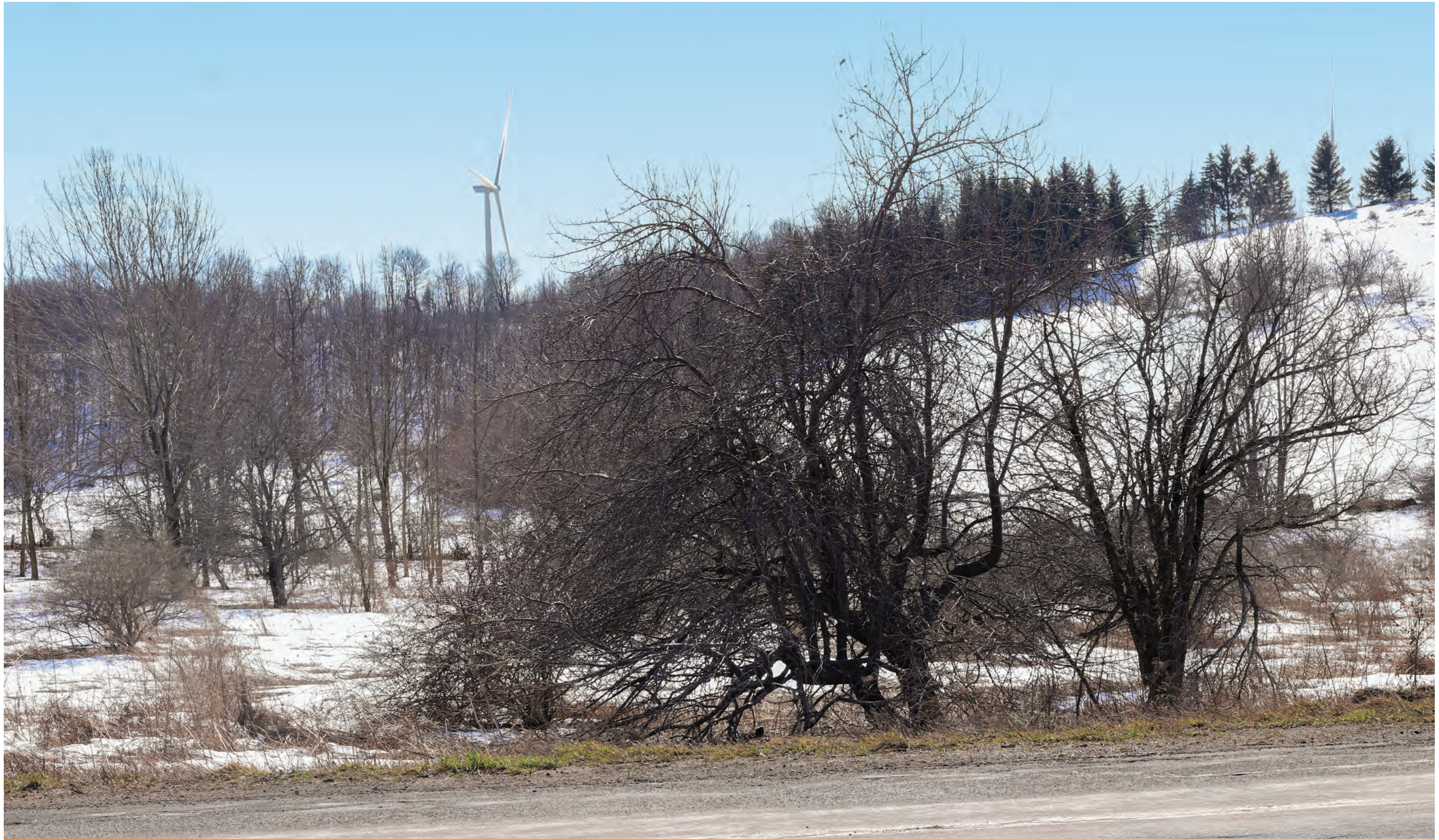
Photo 11 - Jordanville Rd. SIMULATED CONDITION