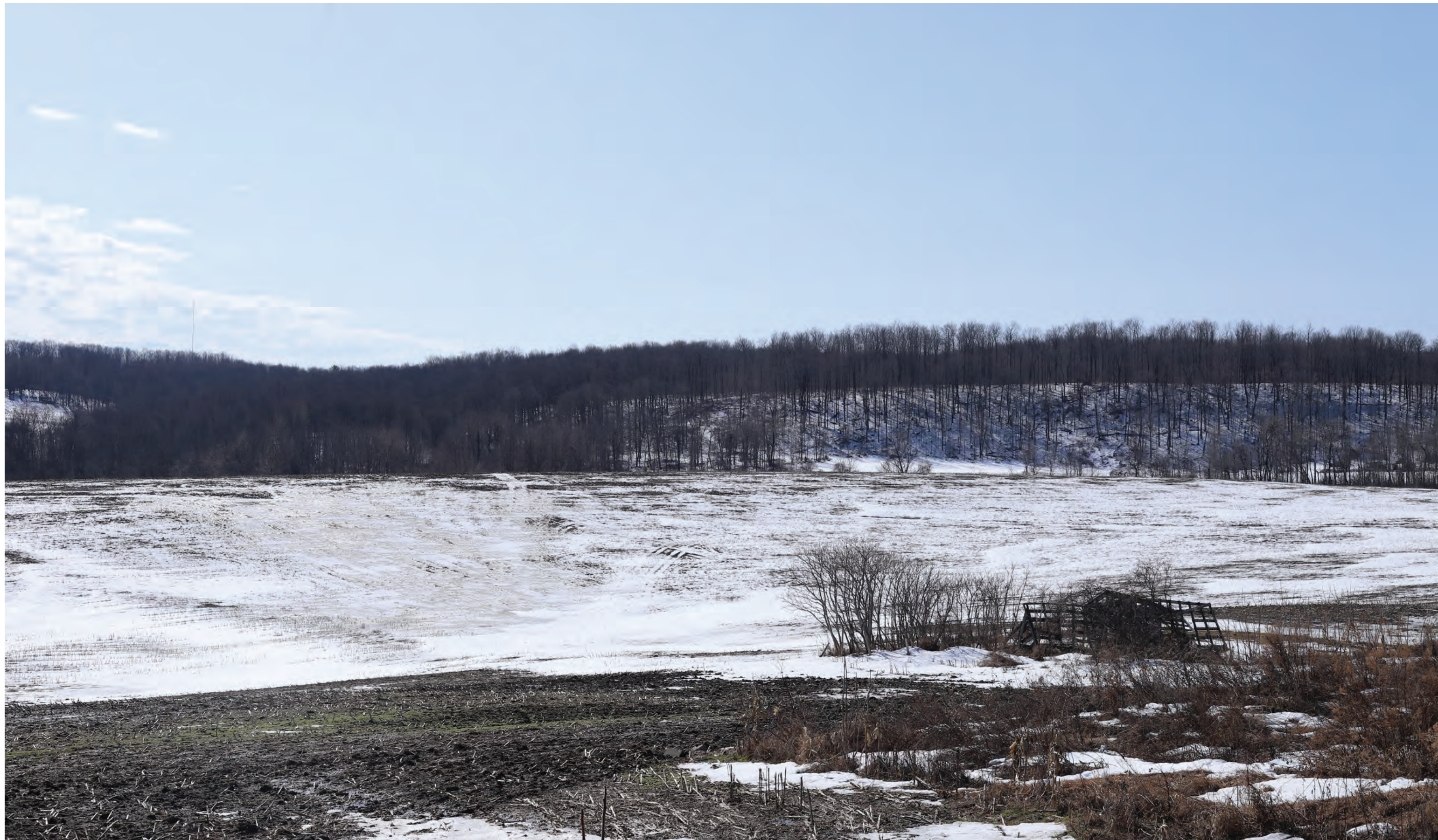
Photo 10 - Jordanville Rd. EXISTING CONDITION