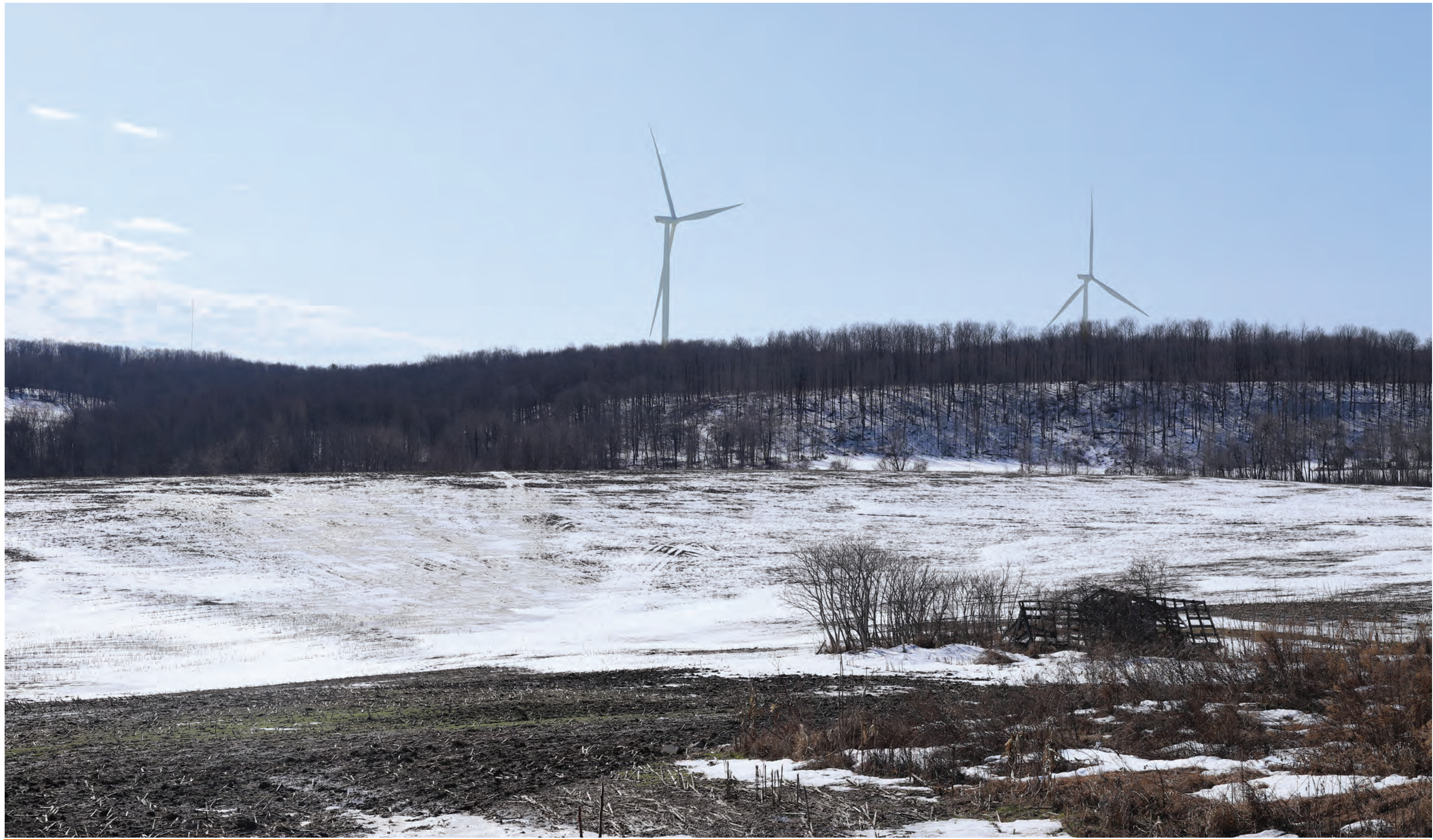
Photo 10 - Jordanville Rd. SIMULATED CONDITION