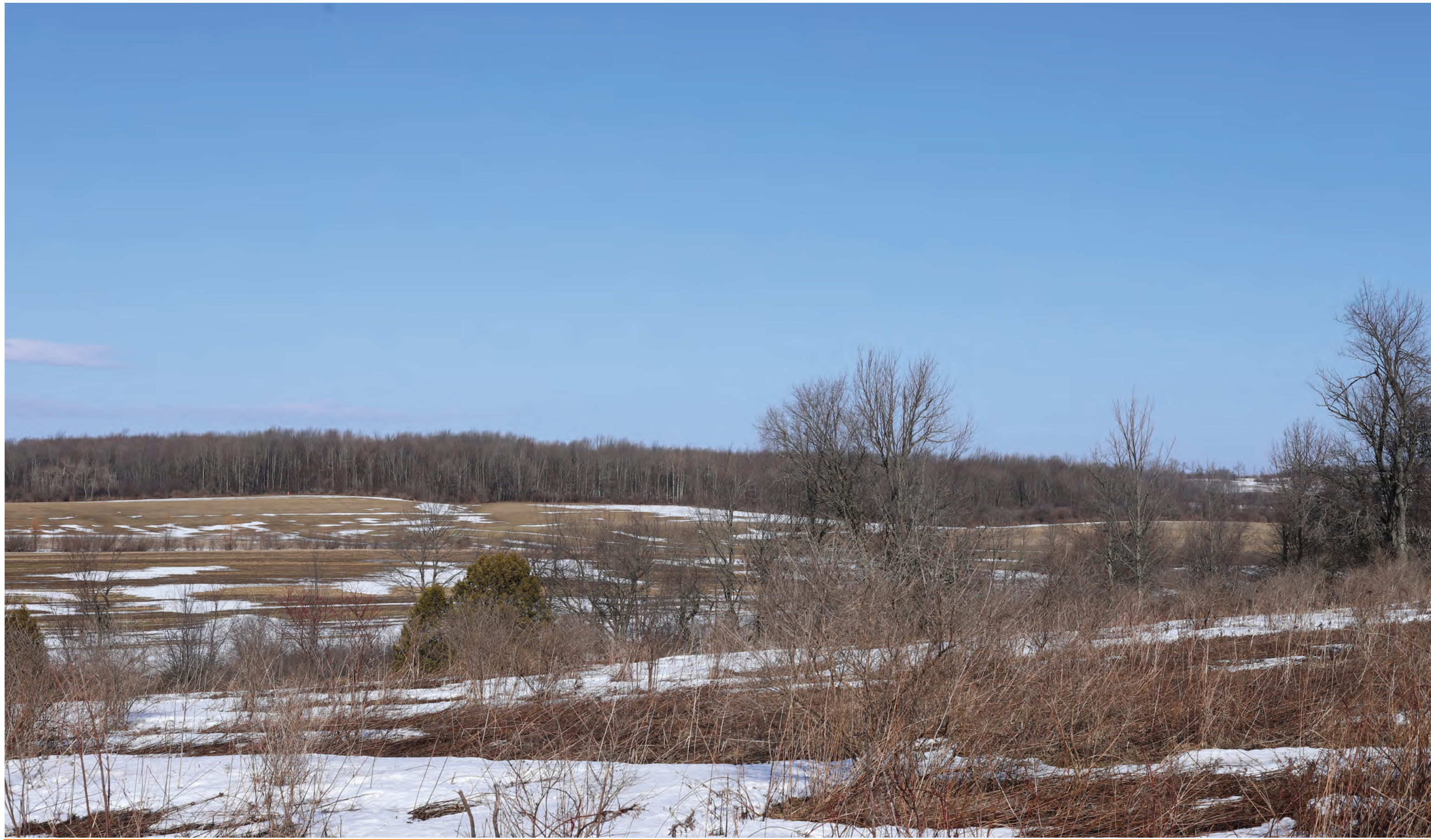
Photo 6 - Chyle Rd. EXISTING CONDITION