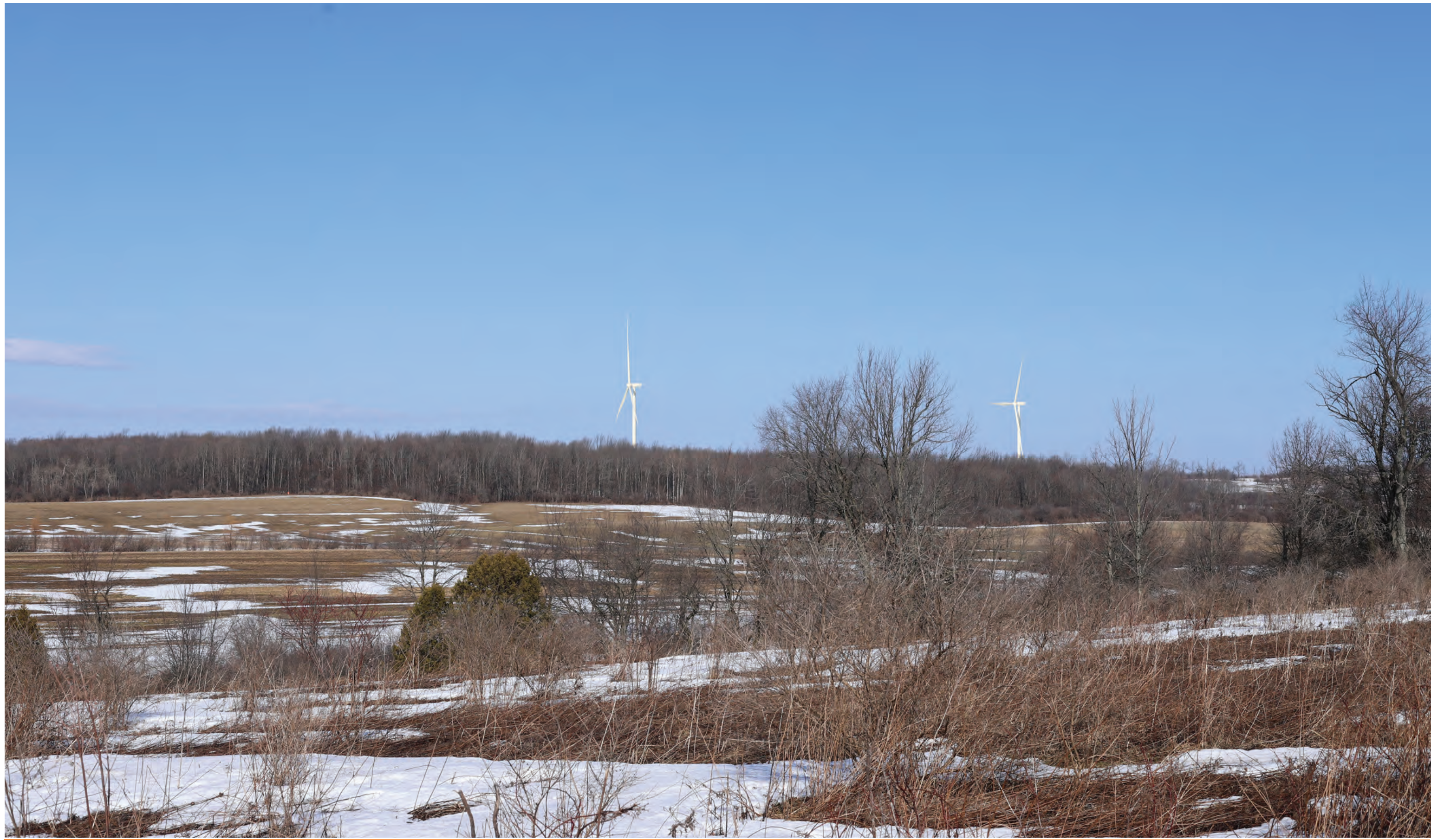
Photo 6 - Chyle Rd. SIMULATED CONDITION