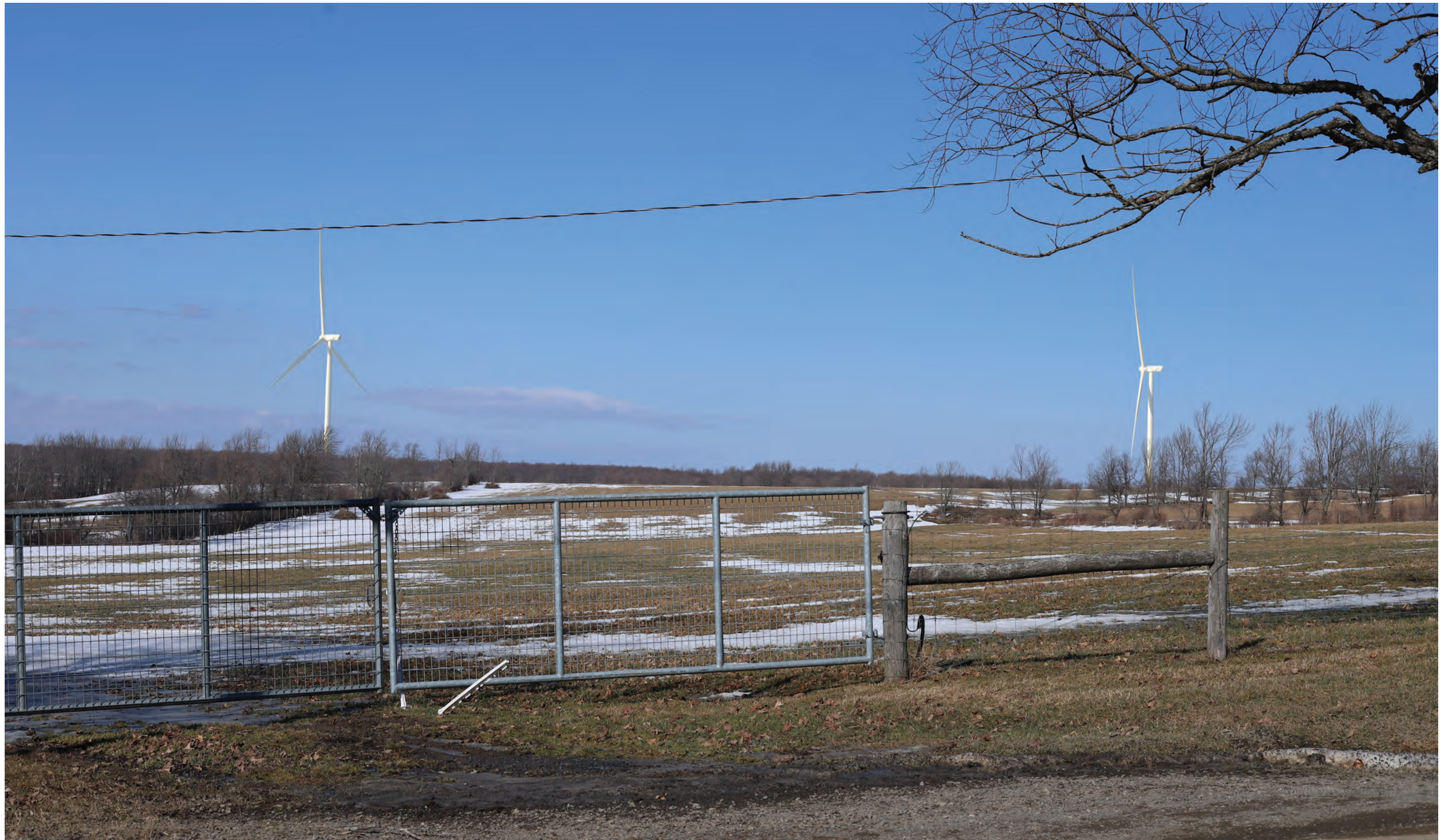
Photo 7 - Chyle Rd. SIMULATED CONDITION