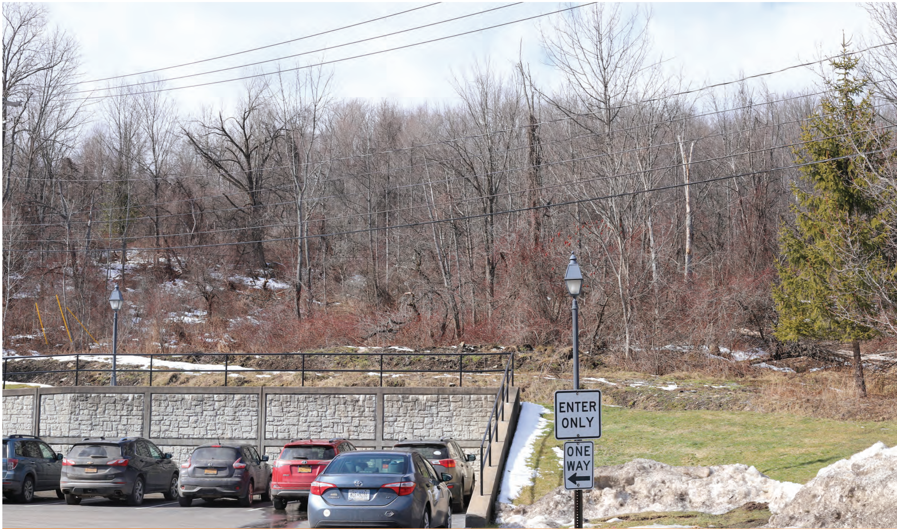
Photo 8 - State Rte. 80 EXISTING CONDITION