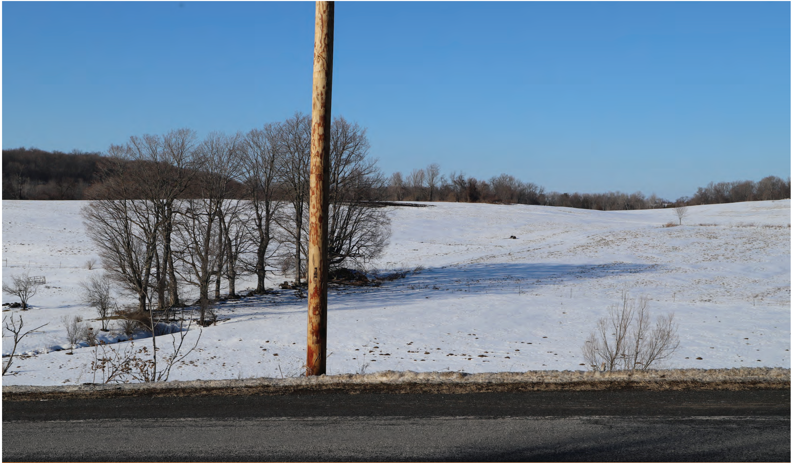
Photo 5 - US Hwy. 20 SIMULATED CONDITION