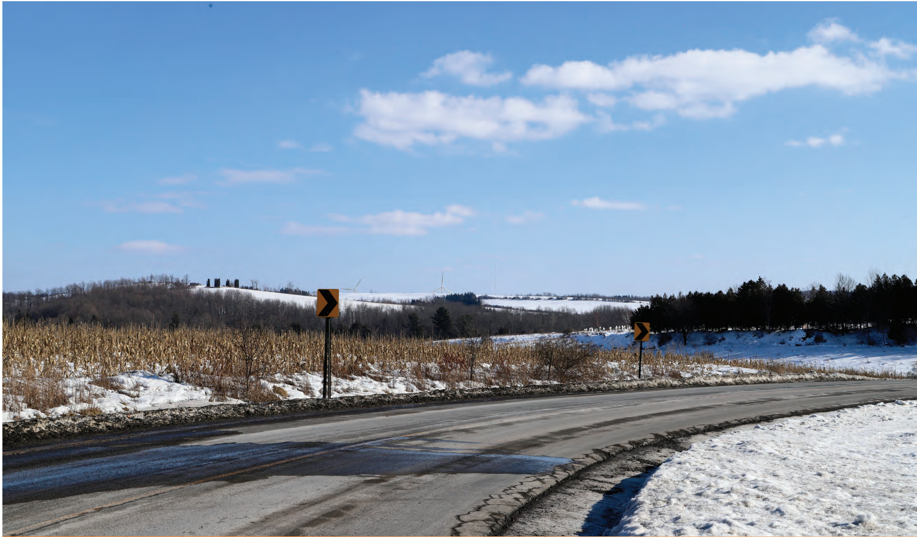
Photo 1 - Robinson Rd SIMULATED CONDITION