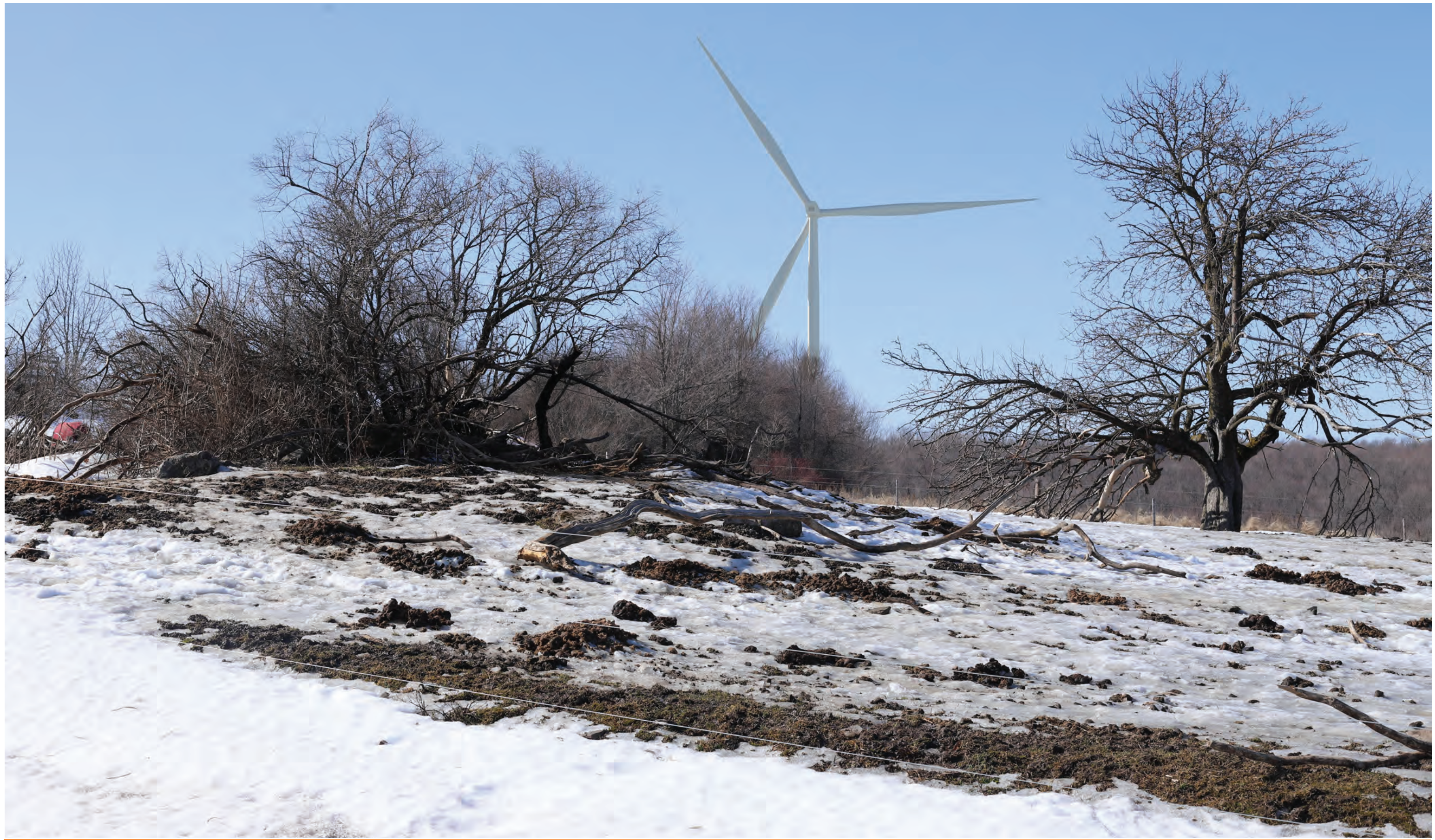
Photo 9 - Sickler Rd. SIMULATED CONDITION