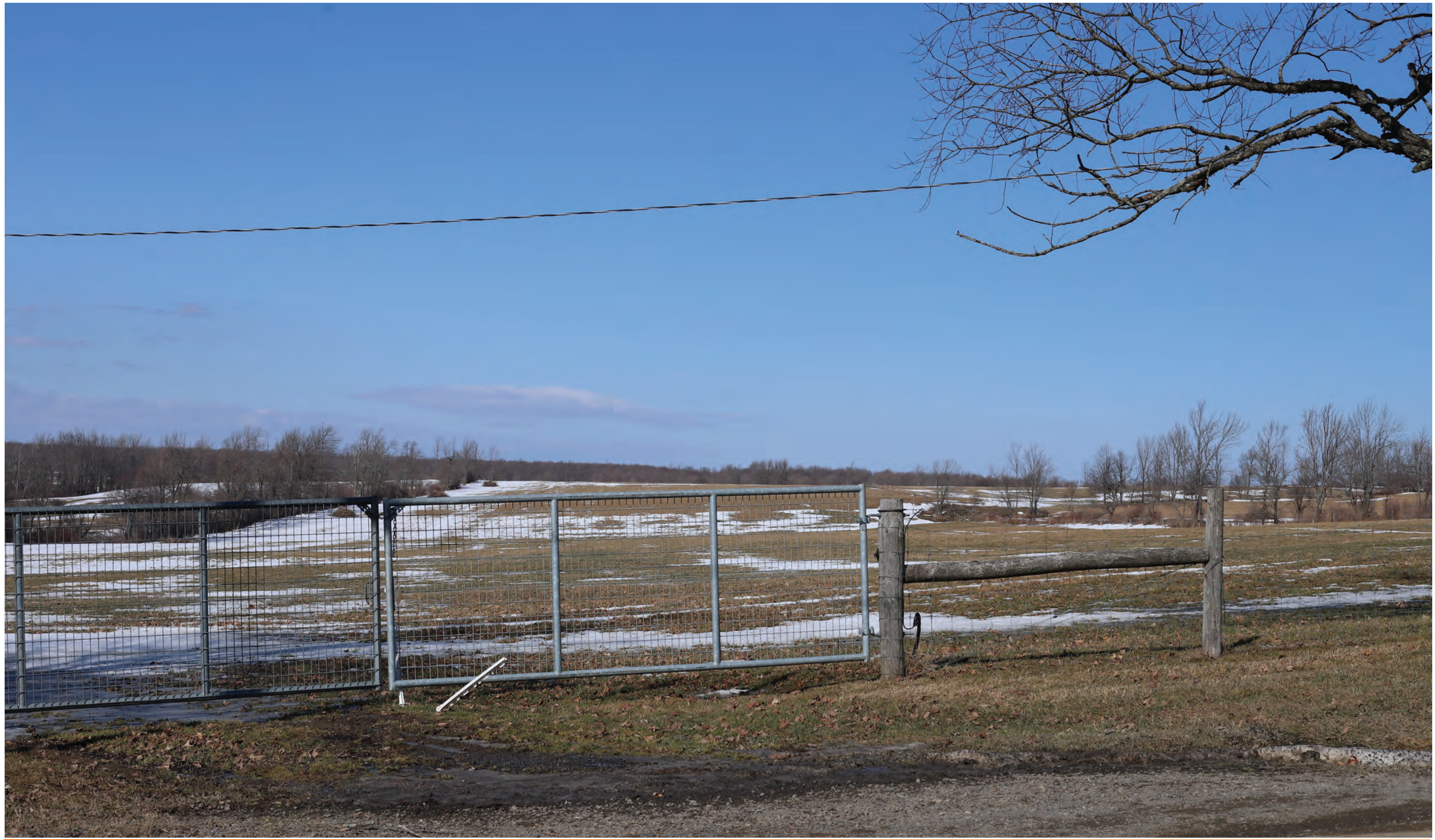
Photo 7 - Chyle Rd. EXISTING CONDITION